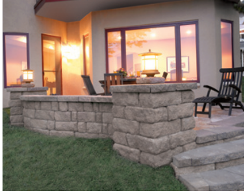
See anchorwall.com for installation instructions.

*Actual dimensions and weight may vary from these approximate dimensions due to variations in manufacturing processes. Specifications may change without notice. See your Anchor representative for details, color options, block dimensions and additional information.